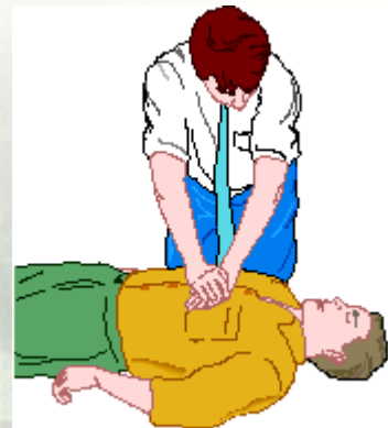
Big Changes for both CPR and Choking!! See inside for details

In February we achieved ISO 9001:2000 certification for our Quality Management, for the "Provision of First Aid and Health and Safety Training and the Supply of Associated Consumables"